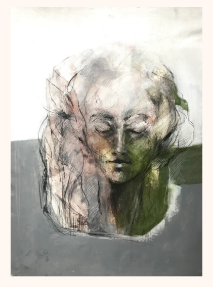
Portrait 3 60x70 cm Mix Media on Paper