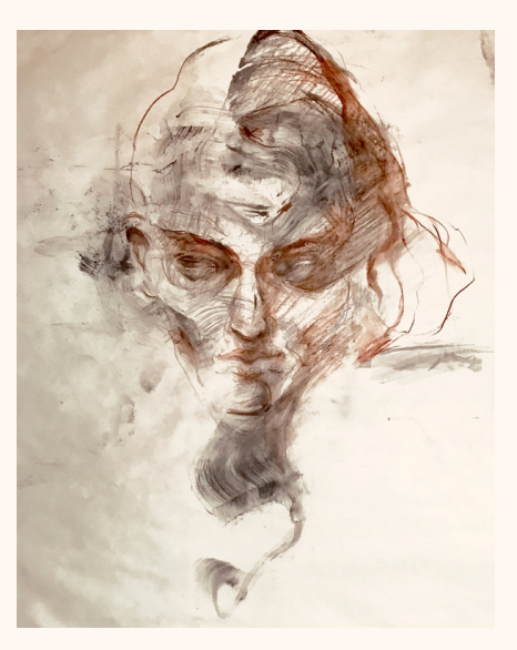
Portrait 2 50x70 cm Charcoal on Paper