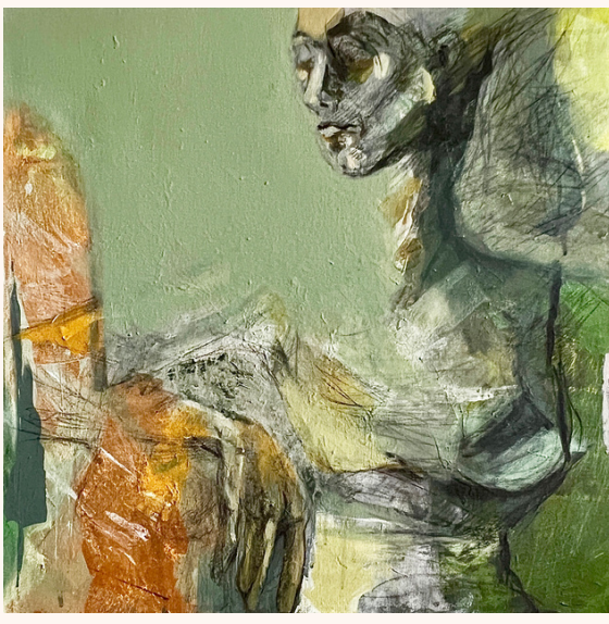
Untitled 50x50 cm Mix Media on Canvas