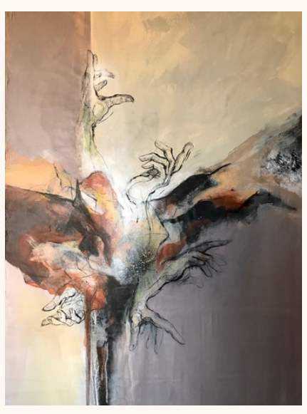
Hands Seeking Freedom 65x80 cm Mix Media on Canvas