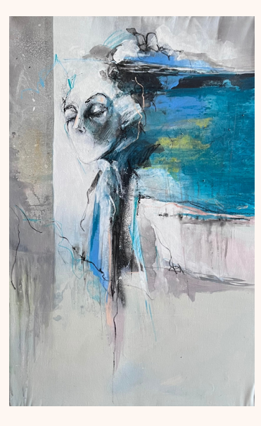
60x80 cm Mix Media on Canvas