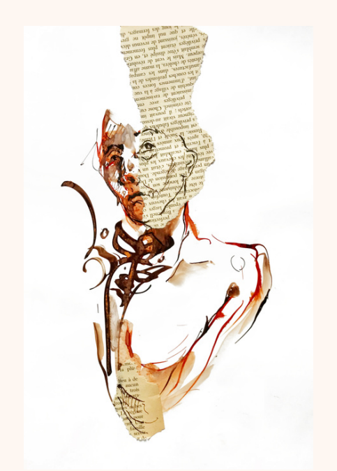
Untitled 29x40 cm Mix Media on Canvas