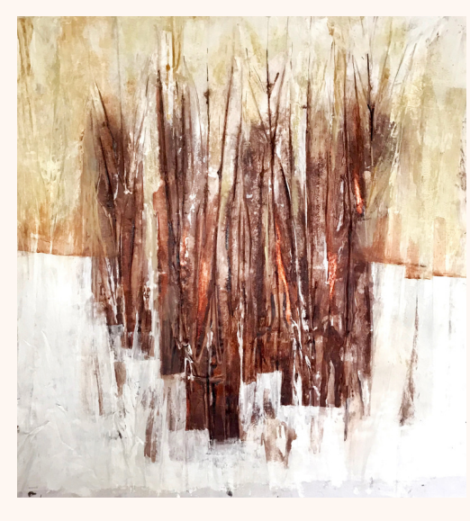
Forest 2 50x50 cm Mix Media on Canvas