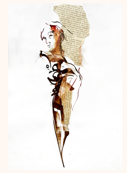
Untitled 29x40 cm Mix Media on Canvas