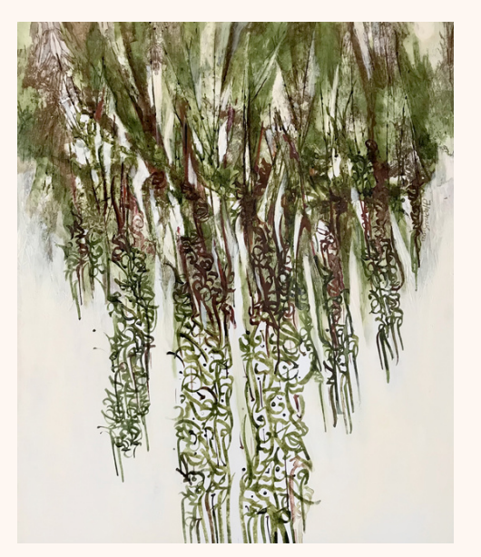
Untitled 190x70 cm Ink on Canvas