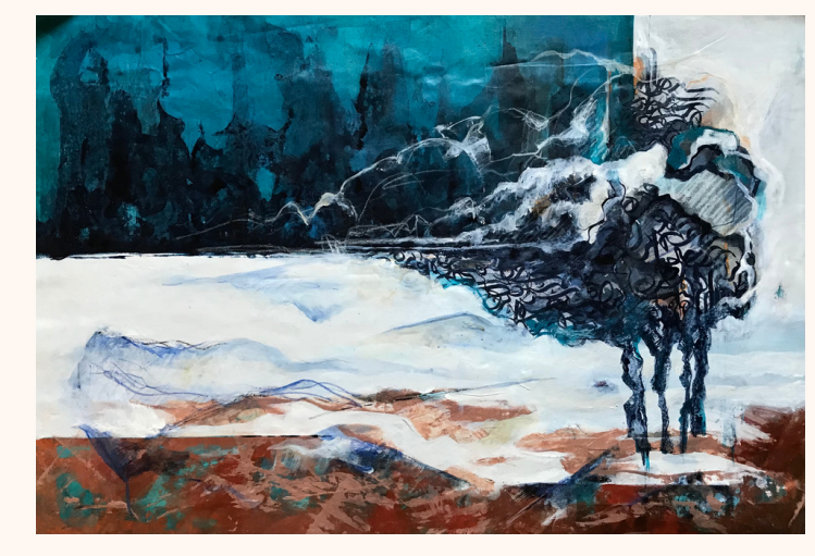
The Tree 100x70 cm Acrylic on Canvas