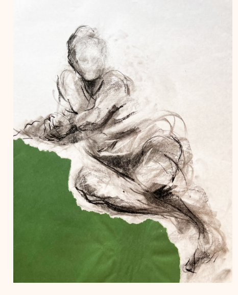
Portrait 10 29x42 cm Mix Media on Paper