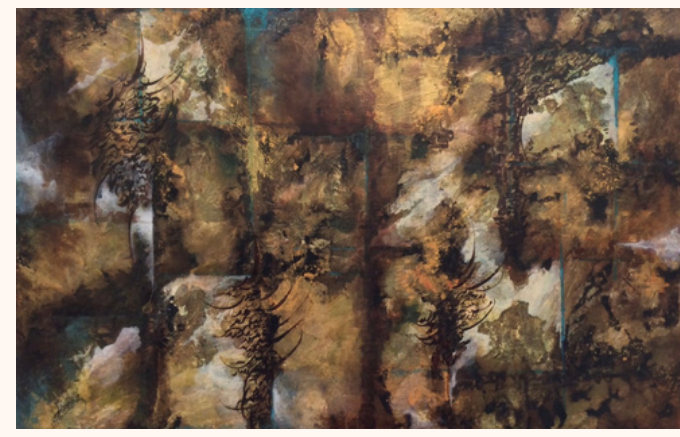
Untitled 90x125 cm Mix Media on Canvas