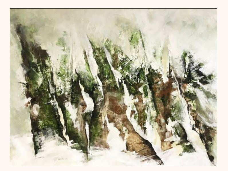
Forest 4 100x120 cm Mix Media on Canvas