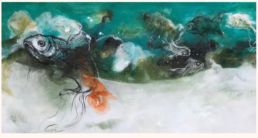
Tiny Black Fish 30x50 cm Mix Media on Canvas