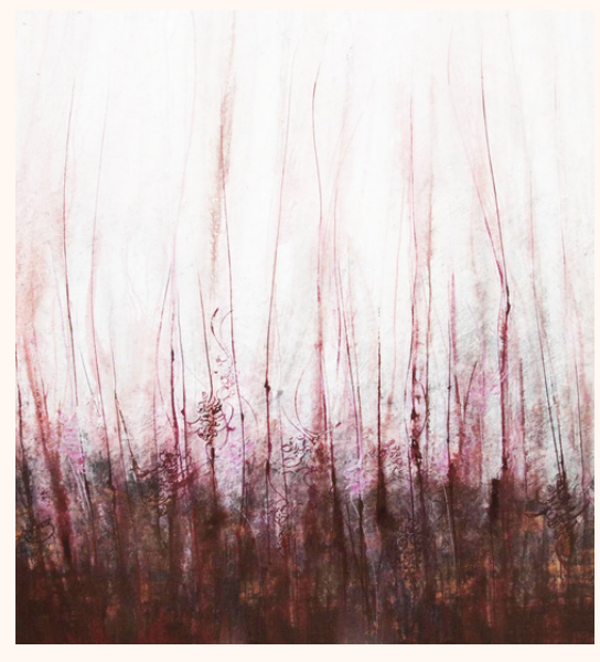
Red Willow Farm 100x120 cm Ink on Canvas