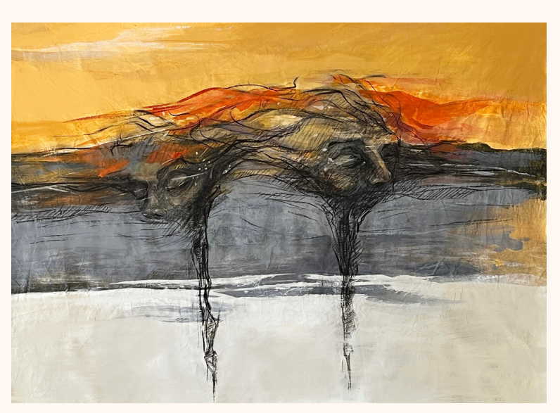
Separate Roots & Common Branches 50x70cm Mix Media on Canvas