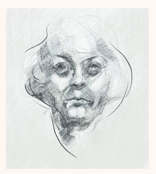
Portrait 5 29x42 cm Pencil on Paper