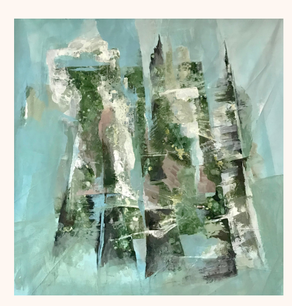
Forest 3 50x50 cm Mix Media on Canvas