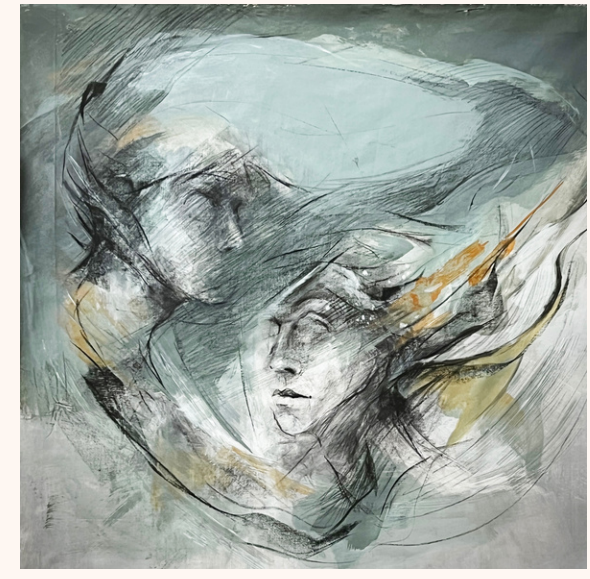
Portrait 12 80x80 cm Mix Media on Canvas