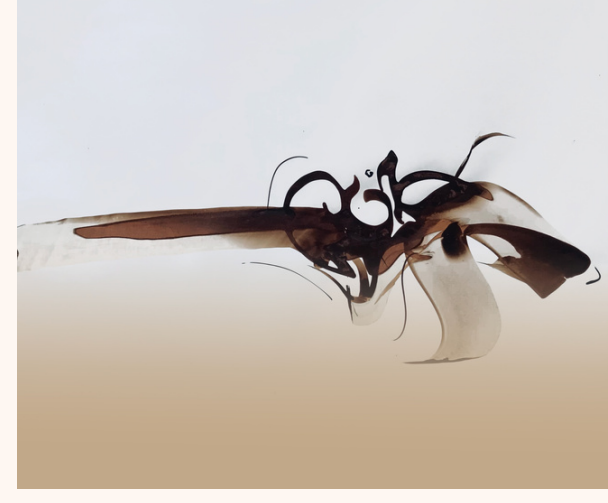
Untitled 30x35 cm Ink on Paper