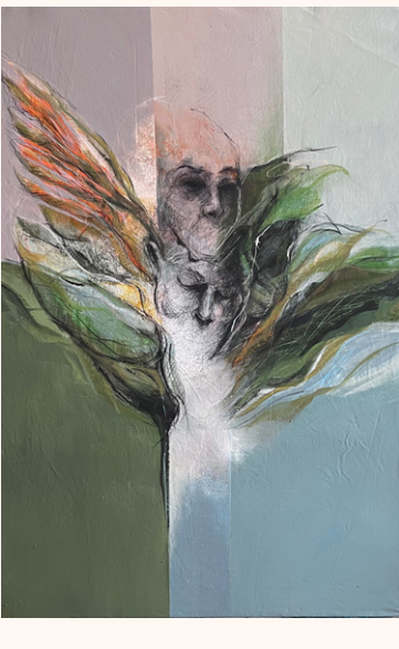
Calmness Before the Storm A Dream as Wide as Ocean 60x80 cm Mix Media on Canvas