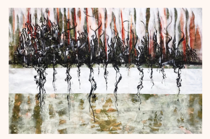
The Roots 100x70 cm Mix Media on Canvas