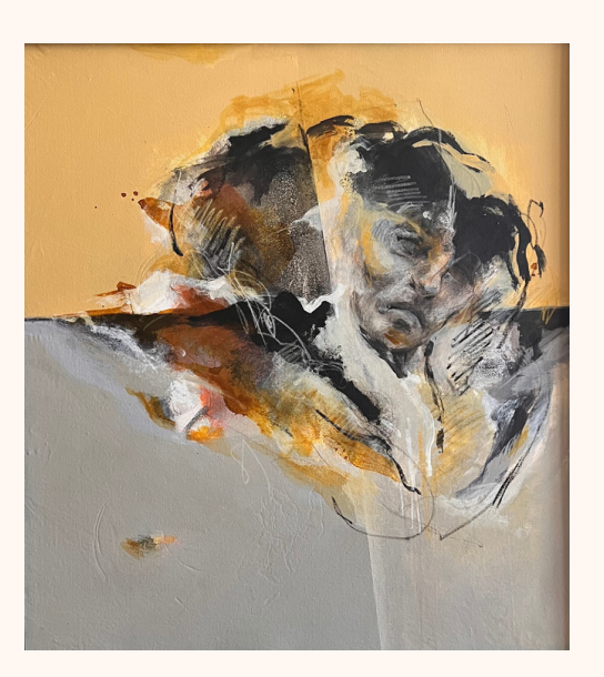
Challenging 70x70 cm Mix Media on Canvas