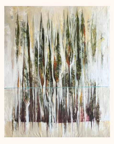
Forest 140x100 cm Mix Media on Canvas