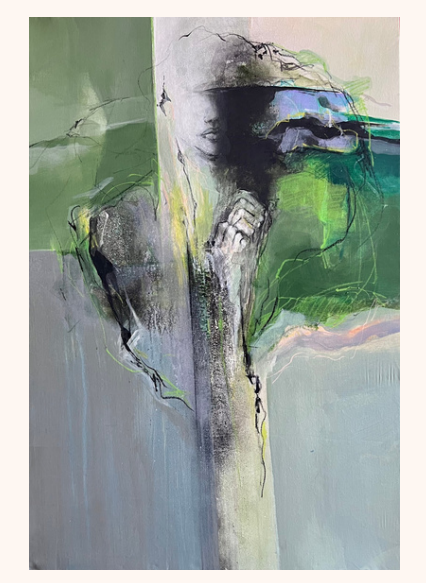
Wishing for a Green Land 60x80 cm Mix Media on Canvas

The environment, when interacting with humans, reflects deep effects to the extent that biological elements can create credible new signs and, from this perspective, establish a new interaction with the audience. The fish collection has played a metaphorical role in shaping this narrative.