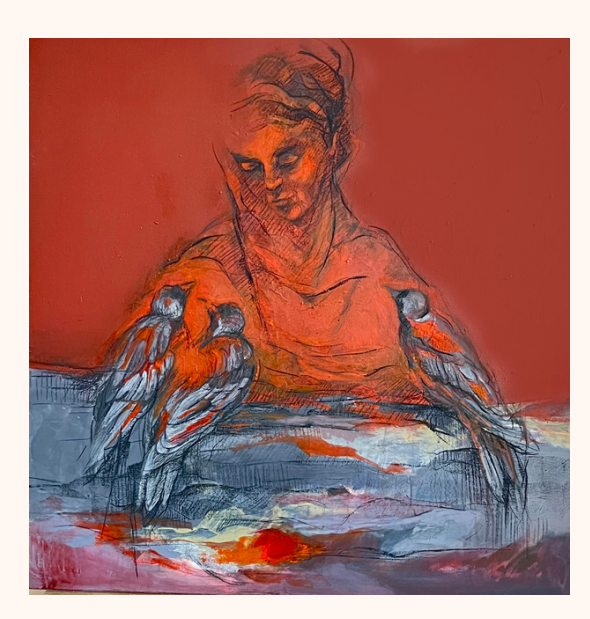
Immigrants 100x100 cm Mix Media on Canvas