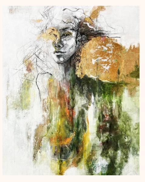
The Missing Eye 30x50 cm Mix Media on Canvas