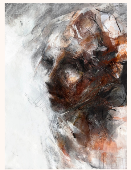
Portrait 1 29x42 cm Digital Painting

Through the expressive strokes of pencil and charcoal, she has created a collection of figurative and portrait drawings, each artwork expressing the essence of humanity and emotion in its purest form.