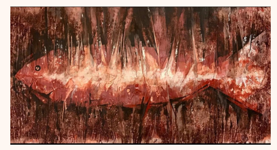
Red Fish 160x80 cm Mix Media on Canvas