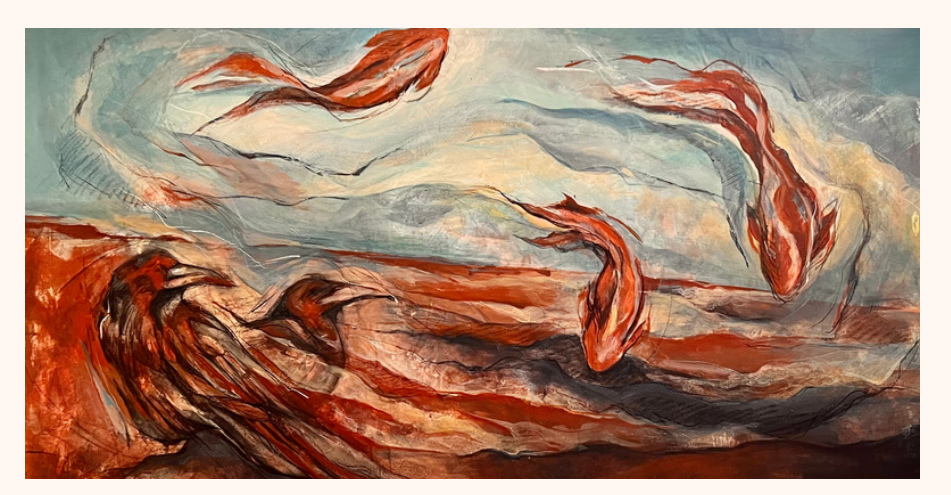
Untitled 150x70 cm Mix Media on Canvas