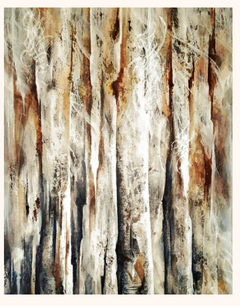
Jungle 120x90 cm Mix Media on Canvas