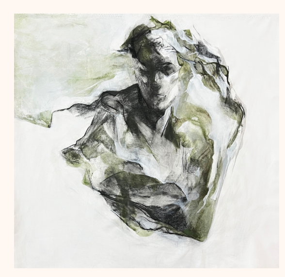
Portrait 7 80x80 cm Mix Media on Canvas