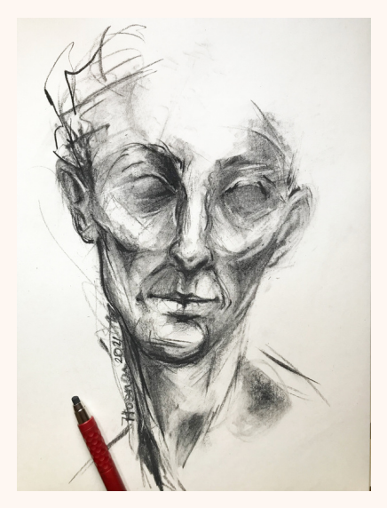
Portrait 4 29x42 cm Charcoal on Paper