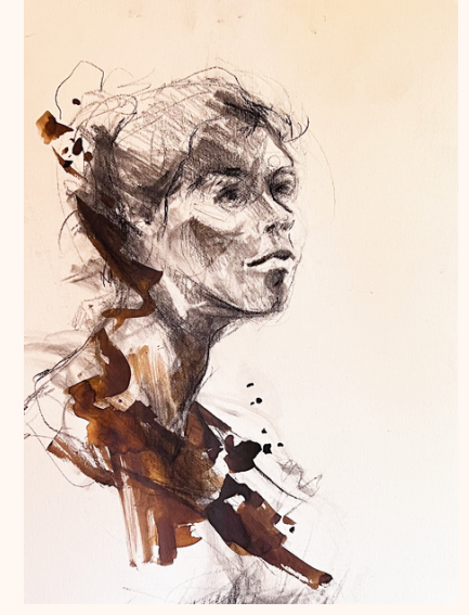
Portrait 9 29x42 cm Mix Media on Paper