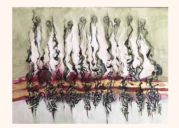
The Roots 2 100x70 cm Mix Media on Canvas