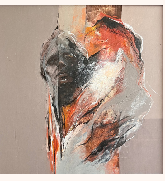
Untitled 70x70 cm Mix Media on Canvas