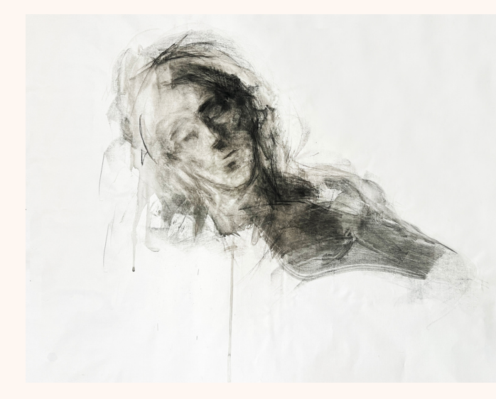
Portrait 8 70x80 cm Charcoal on Canvas