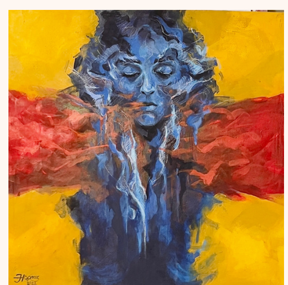
Me as a Woman 90x90 cm Mix Media on Canvas

Several paintings have been created during her life that do not belong to any particular collection, reflecting the emotional and atmospheric conditions she was experiencing at the time.