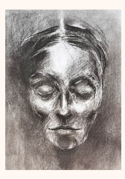
Portrait 6 29x42 cm Charcoal on Paper