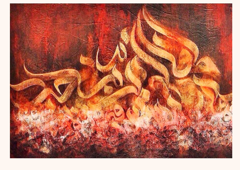
Untitled 125x90 cm Acrylic on Canvas