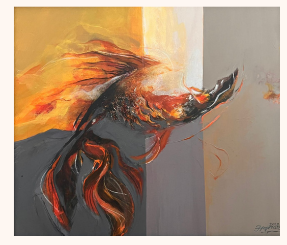
There is no sign of Nowrouz in You 70x70 cm Mix Media on Canvas