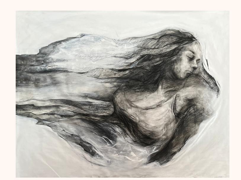
Woman 100x80 cm Mix Media on Canvas