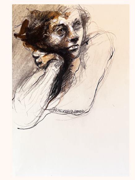
Portrait 11 29x42 cm Mix Media on Paper